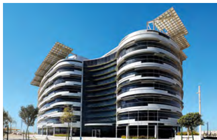
International Renewable Energy Agency (IRENA) HQ Awarded the 4 Pearl Estidama certification in 2014 and The Big Project Middle East Award.