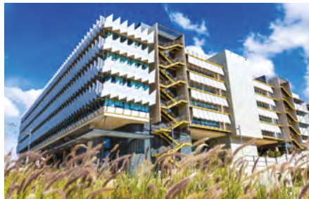
Siemens Middle East HQ LEED Platinum and 3 Pearl Estidama certifications. MEED Quality Award for Projects 2013.