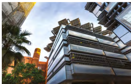
Masdar Institute of Science and Technology Leading research in the fields of advanced energy applications and sustainable technologies. Awarded British Expertise International Awards 2013.