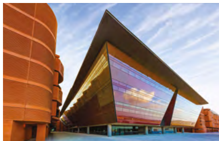
Incubator Building Home to many entrepreneurial businesses and the convenient One-Stop Shop which offers several vital business services.