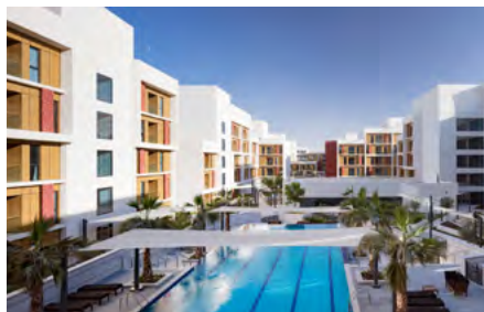
Etihad Eco Residence LEED Gold and 3 Pearl Estidama rated. Offers 500 units, comprising 1-bed and 2-bed apartments.